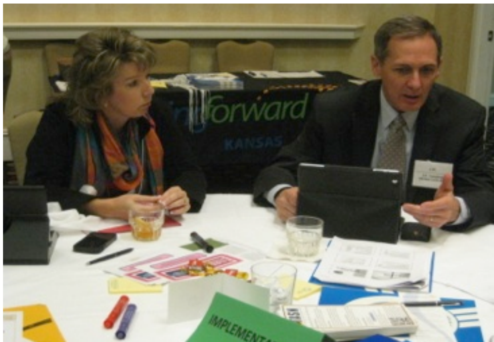
2012 Professional Learning Standard Pre-Conference, sponsored by LF KS

Learning Forward Kansas Membership included - a $25 value!